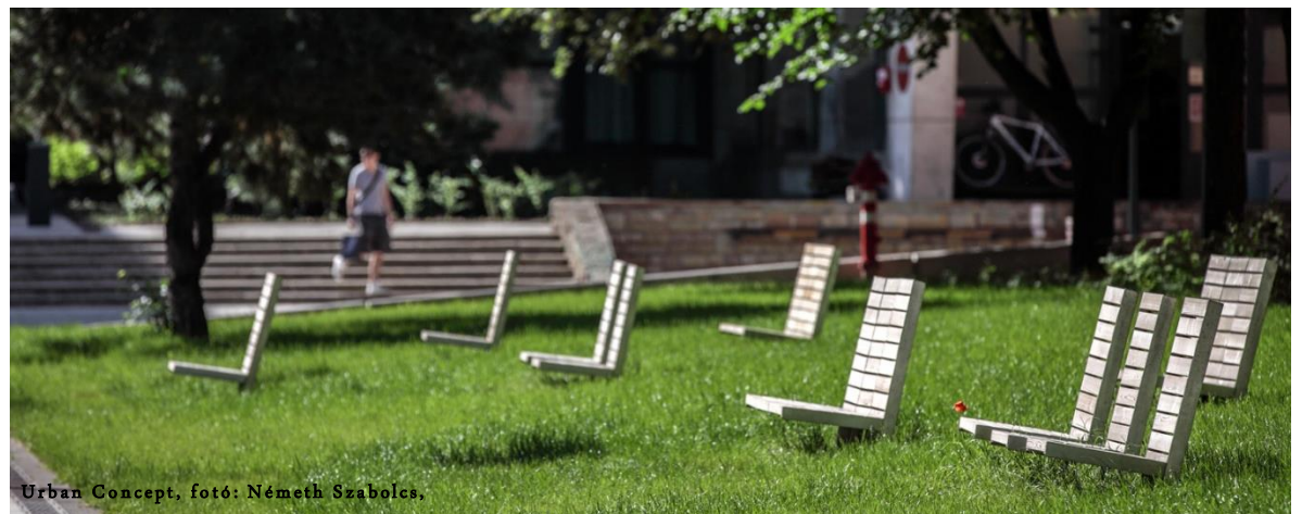
Urban Concept